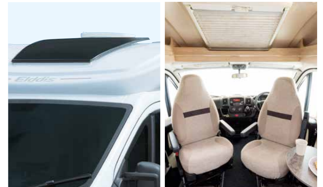
Accordo models come with Sky-view® opening cab sunroof with pleated blind as standard.