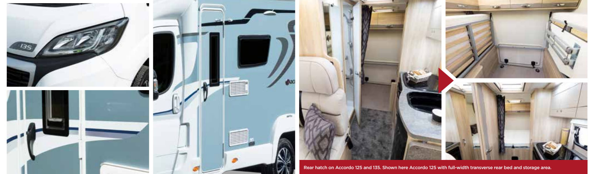
Rear hatch on Accordo 125 and 135. Shown here Accordo 125 with full-width transverse rear bed and storage area.