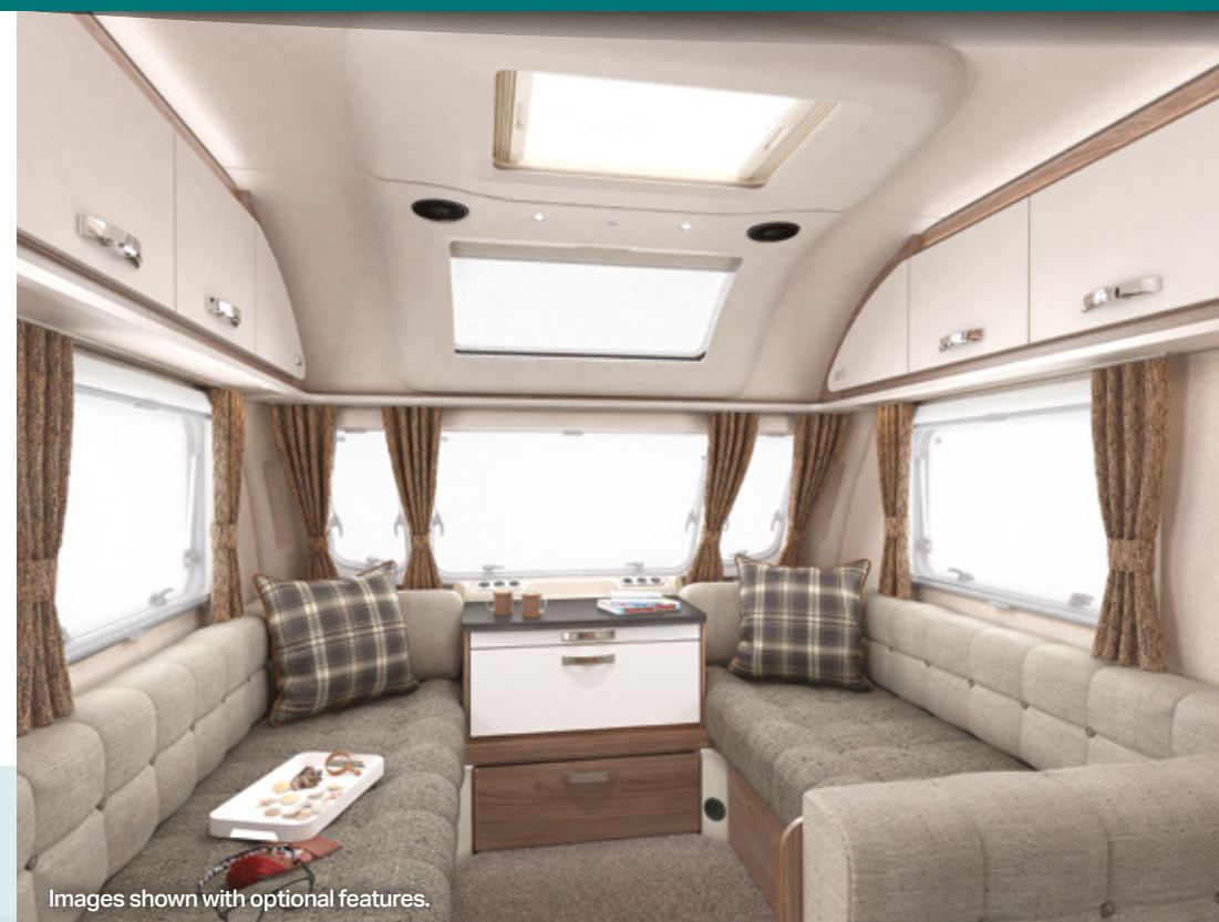
Images shown with optional features.

The UK's best-selling, multi-award winning caravan range, Sprite has been stunningly redesigned inside and out for 2020. Sprite Super extends the appeal to 8ft-wide for even more living space.