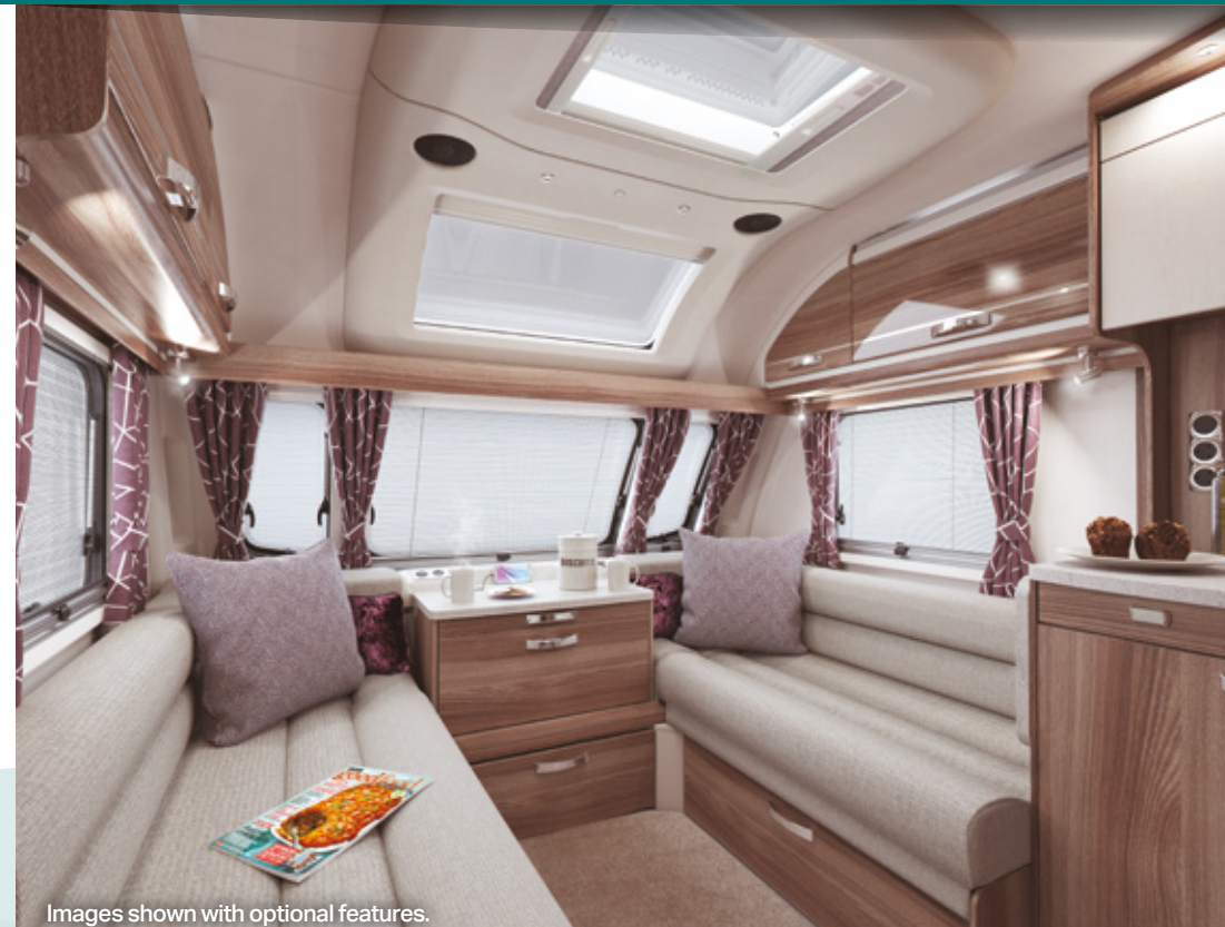
Images shown with optional features.

Now joined by the all-new 8ft-wide Challenger X for an even roomier interior, the Challenger range combines outstanding looks, equipment and value, with the exciting addition of Alde heating as standard.