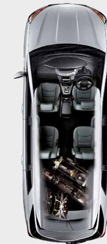
Third row seats removed.