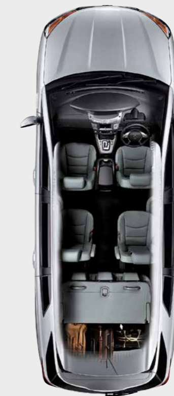
Third row seats folded.