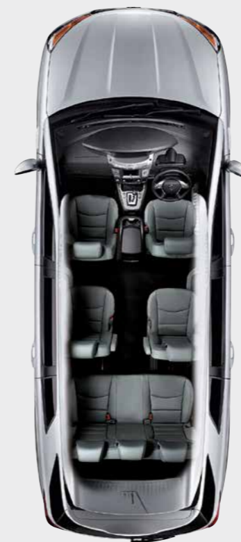
All seats facing forward.