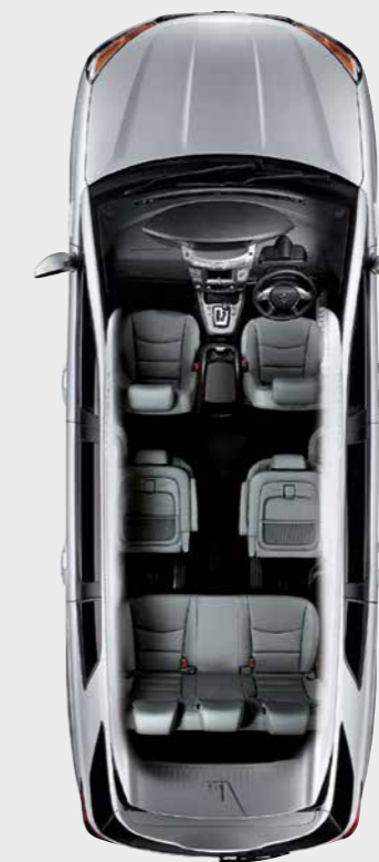
Second row seats folded.