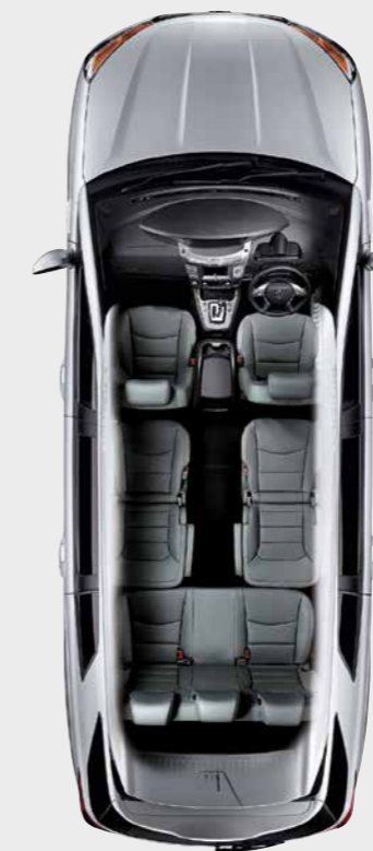
Second row seats flat.