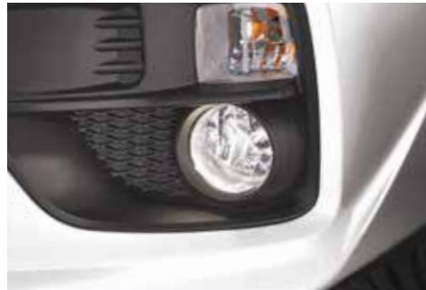
Front Fog Lamps