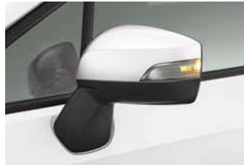
Power-folding Door Mirrors with Built-in LED Turn Signal