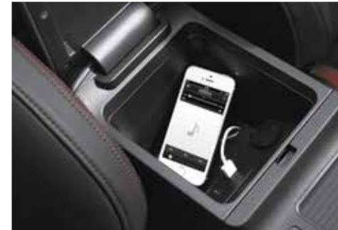
USB and Auxiliary Audio Input Jack (in the centre console box)