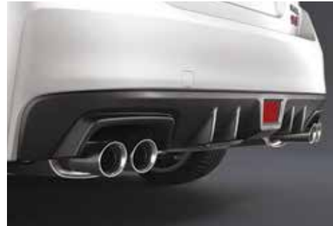
Rear Diffuser and Twin Dual Tail Muffler