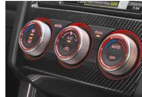
Dual Zone Automatic Air-conditioning System