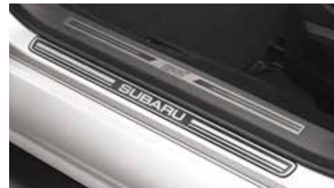
Side Sill Plate