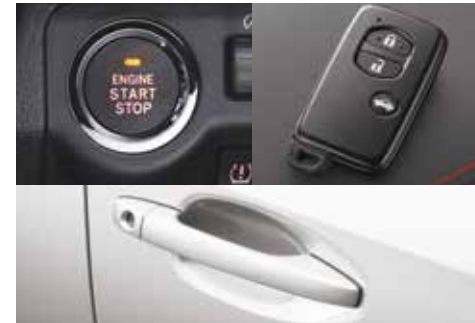
Keyless Access and Push Button Start System