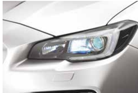
LED Headlamps with Auto Leveliser