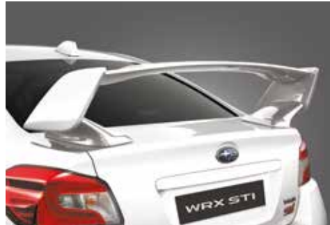
Large Rear Spoiler