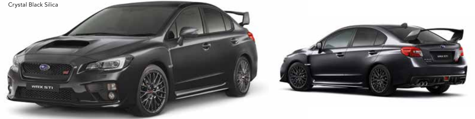
Crystal Black Silica