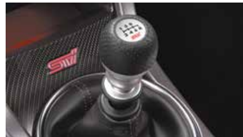
Leather Shift Knob