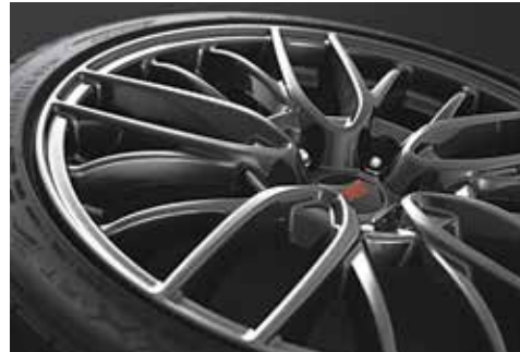
18-inch Aluminium Alloy Wheels (Dark Gun-metallic)